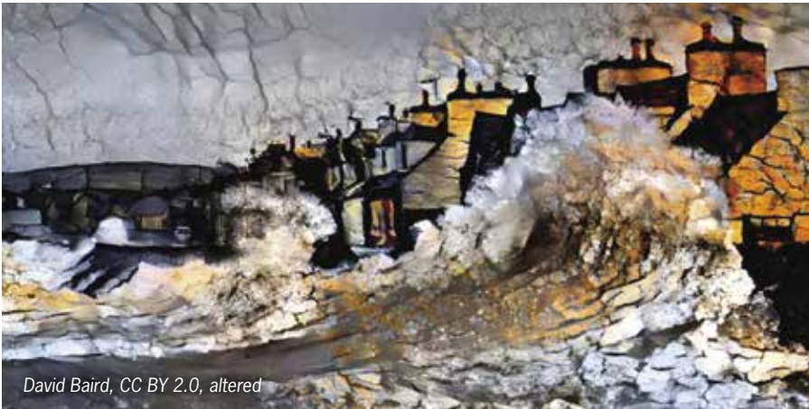
David Baird, CC BY 2.0, altered